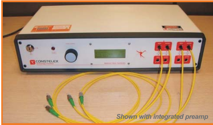
Shown with integrated preamp